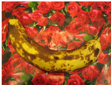
Figure 1: The test image for binary image segmentation.

Exercise 2 (Binary image segmentation via maxFlow algorithm, 6 Points). Solve the binary image segmentation problem on the image in Figure 1 by applying the Boykov-Kolmogorov maxFlow algorithm .